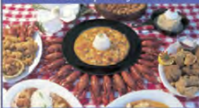
No Meeting...without Eating!

NON PROFIT ORGN. U.S. POSTAGE PAID LAFAYETTE, LA 70504 PERMIT NO. 218